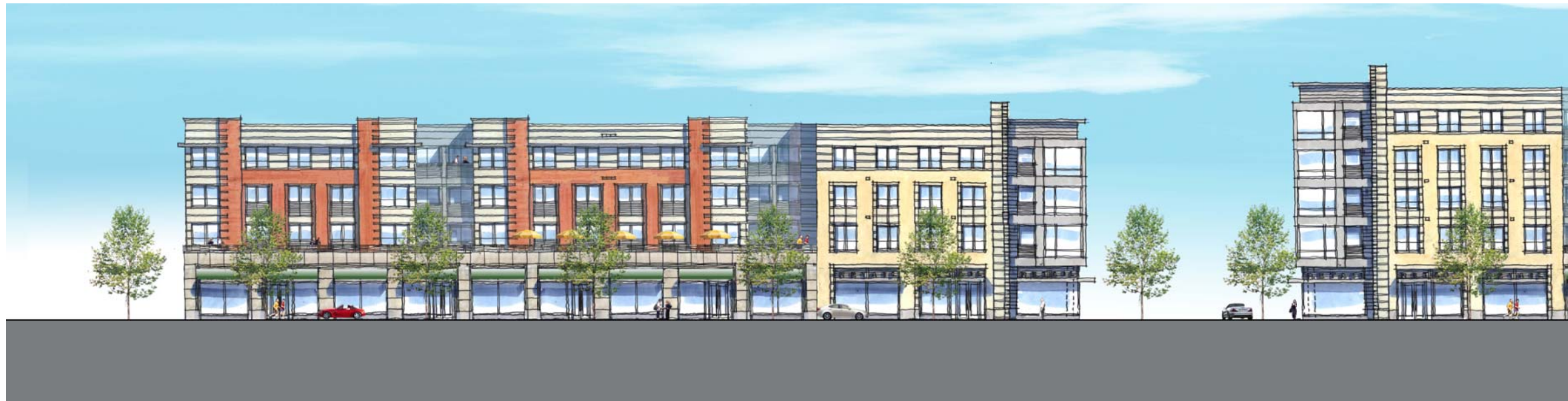
2 BLDG #1 PERSHING DRIVE ELEVATION - SPRC #6