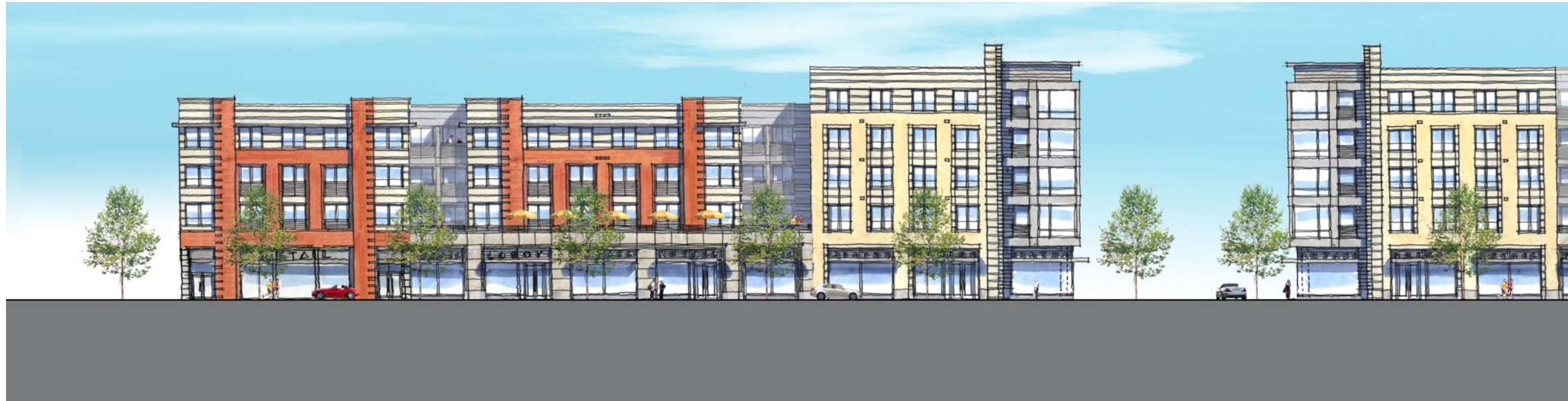
1 BLDG #1 PERSHING DRIVE ELEVATION - SPRC #5